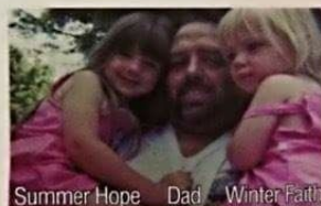
Summer Hope Dad Winter Faith

$59 Service Call $60 per lb Freon FREE Estimates